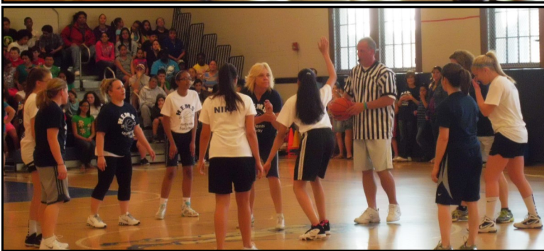
(Above) Faculty members challenge the 8th grade boys' and girls' basketball team members during a fundraising event sponsored by the PTA at The Castle on May 2, 2013.